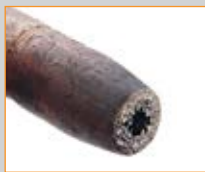
Nozzle fully clogged (not using E-Weld Nozzle)