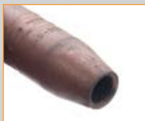
Nozzle using E-Weld Nozzle