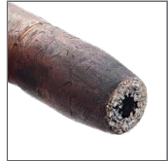
STANDARD OEM NOZZLE FULLY CLOGGED