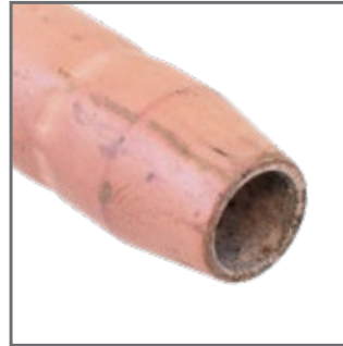
E-WELD PRE-COATED NOZZLES™